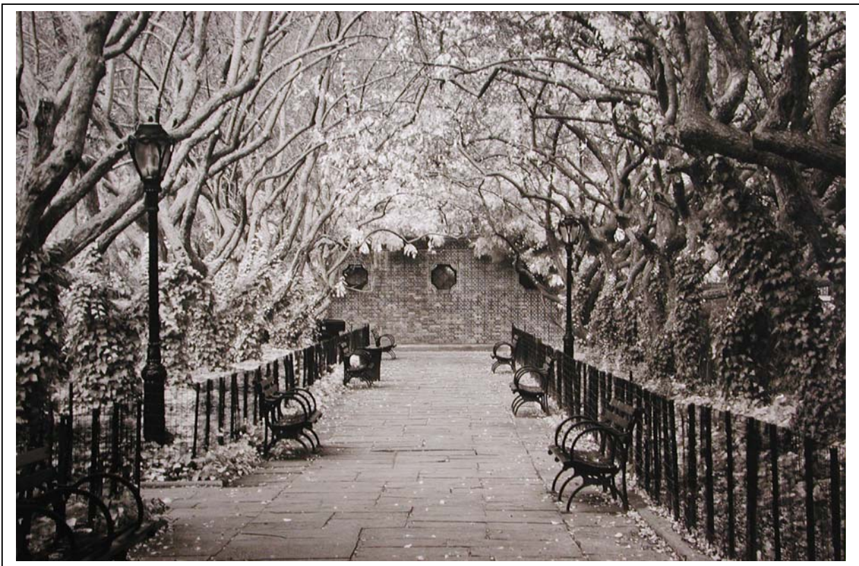
Conservatory Garden – May 2008 Salon – by Cynthia Fleury