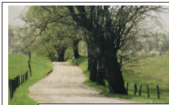
Cynthia Fleury - Misty Morn Cales Cove - 10