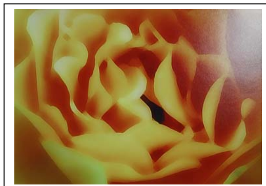
Brian Billadeau - Painterly Rose - 9

All images are the property of the makers and cannot be used without express permission by the maker.