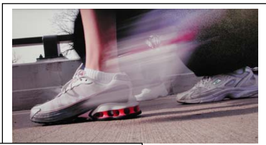
Geoff Kuchera - Speed - 9