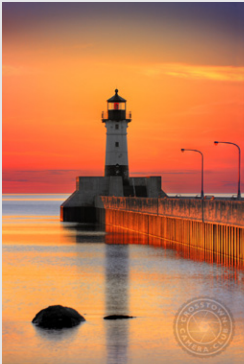
Digital Image of the Year: Harbor Light – Holly Kuchera