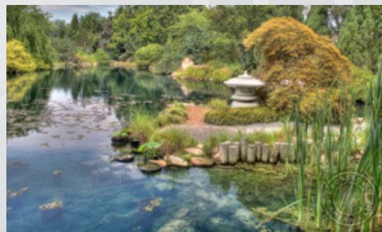
Color Print Runner-Up: Ginter Japanese Garden – Cynthia Fleury